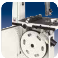
Cast-iron Saw Wheels solidity