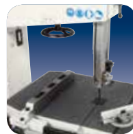
Protection safety first