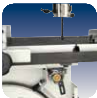
Blade Guide perfect results